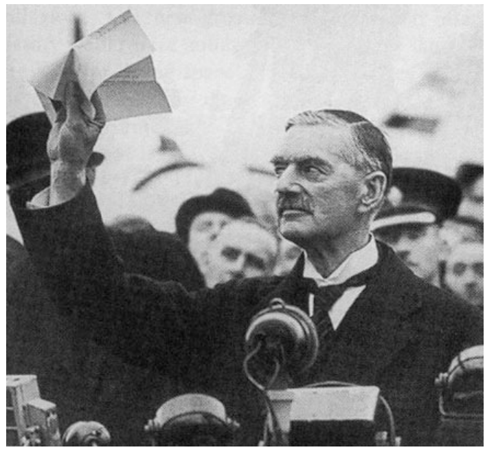
Arthur Neville Chamberlain in 1938, at <u>Munich Betrayal</u>, then brandishing the signed document upon his return: Peace is saved!